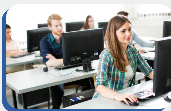
Functional Skills Test Platform for Training Qualifications UK (TQUK)